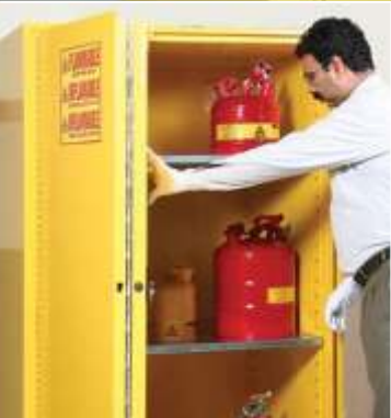
Bi-Fold Self-Closing Doors