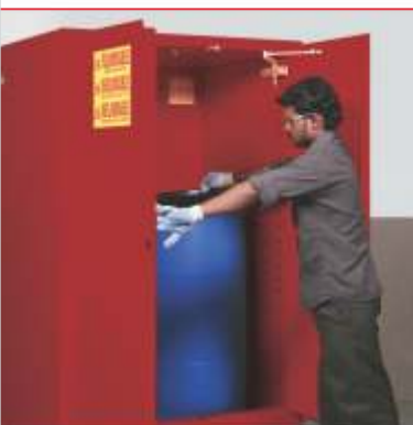
Safely store large drums of hazardous liquids