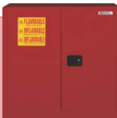
44" tall, 30 gallon capacity