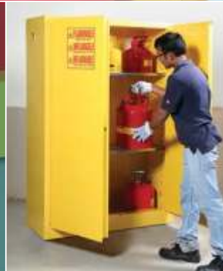
Each door latches open with a fusible link