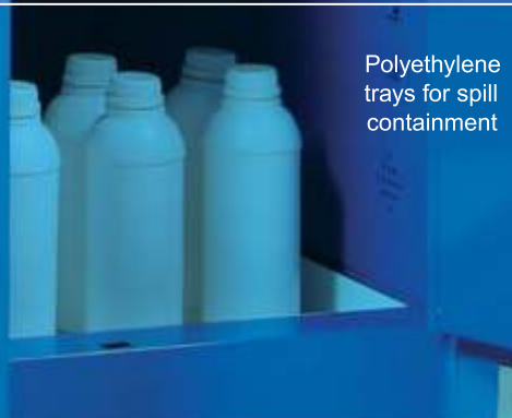
Polyethylene trays for spill containment