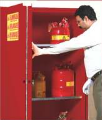
Bi-fold Self-Closing Doors