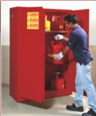
Each door latches open with a fusible link