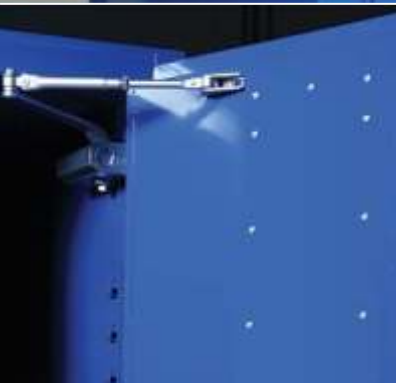
Removable panel to service three point latching mechanism